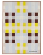
December Evelina Kroon