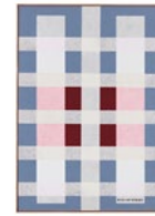
Februari Evelina Kroon

Despite their slim 45 mm profile, the panels offer exceptional acoustic performance. They are available in three sizes (including frame): 1025 x 1425 mm 725 x 1025 mm 525 x 725 mm