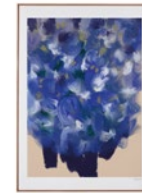
Flower bath Lisa Wirenfelt