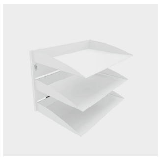
Sorting compartment 3xC4