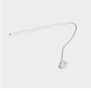
Flexible LED lamp