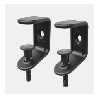
Clamp fittings Black, white or grey