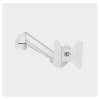
Monitor arm LC55