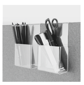
Plexi pen holder