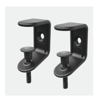
Clamp fittings Black, white or grey