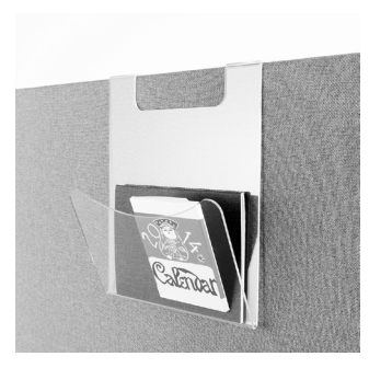
Plexi letter holde