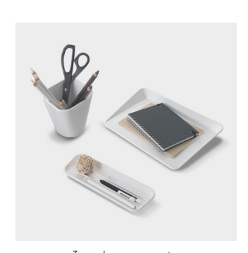
3-pack components wide shelf/narrow shelf/pen cup

-Soneo suspended desk screen, with toolbar