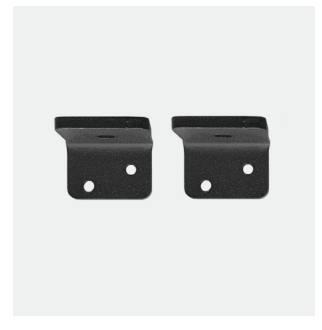
Hidden fittings Black, white or grey