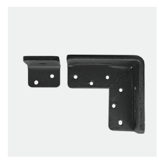
(2 x) Hidden fittings Black, white or grey