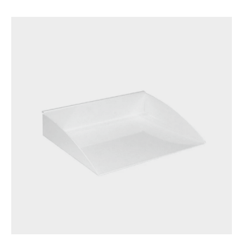
System shelf C4