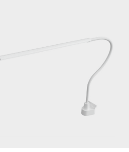
Flexible LED lamp