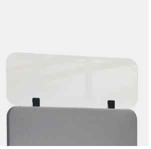
Plexi upper section 800/1000/1200/1400/1600/1800/2000 x285 mm