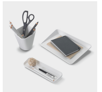
3-pack components wide shelf/narrow shelf/pen cup

-Softline suspended desk screen, with toolbar