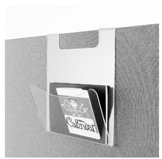
Plexi shelf Post box