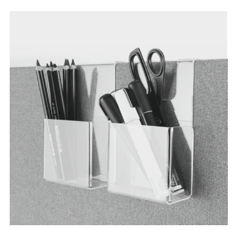
Plexi shelf Pen holder