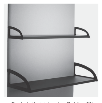
Black shelf with bracket (Softline 50) 800/1000x180 mm 800/1000x280 mm