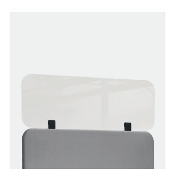
Plexi upper section 800/1000/1200/1400/1600/1800/2000 x285 mm