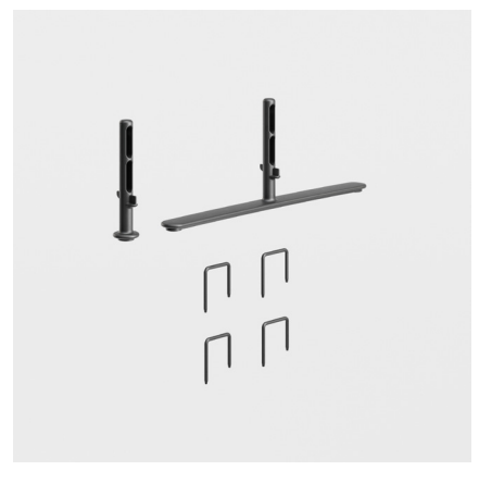
Leg set, expander pack