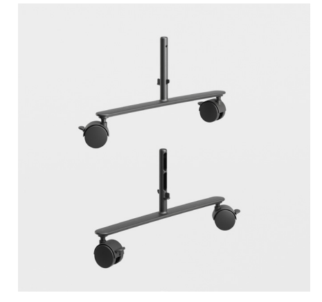
Leg set with lockable wheels