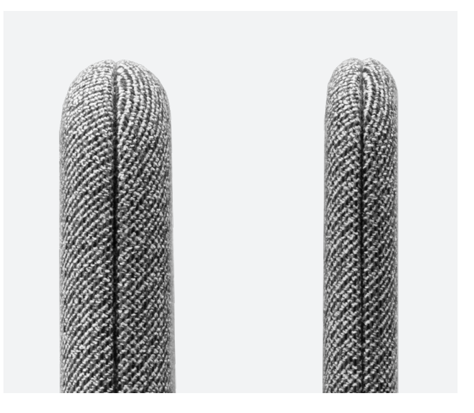
Two different screen thicknesses. Choose 30 mm for a thinner, sleeker appearance. Choose 50 mm for even better sound absorbing features!

abstracta.se/product/softline-office-screen/